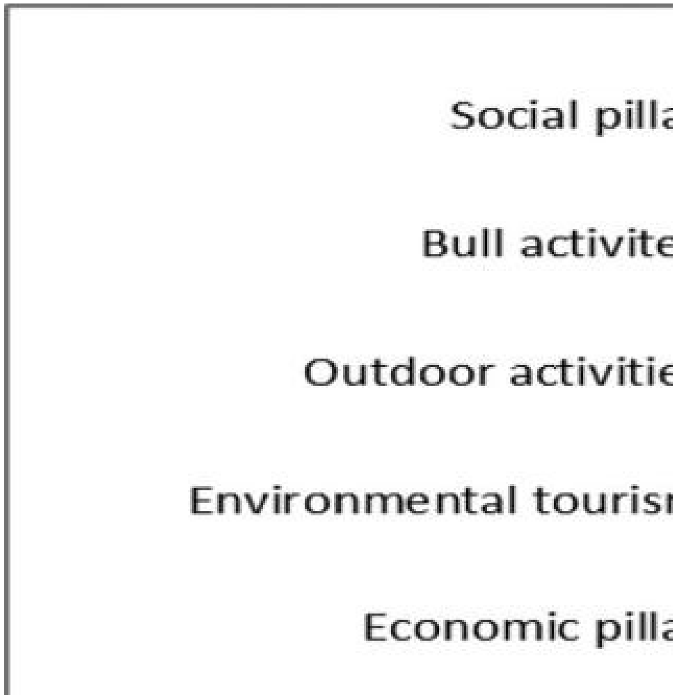
Figure 3. Percentage of the participants who agree with the current sustainable development management strategies in the Camargue as expressed as individual activities and the pillars of sustainable development.

“agricultural changes,” “changes in water levels in the wetlands” and “poor quality of water.” The concepts linked to the theme “WATER” were “management” (58%), “salinas” (58%), “lagoons” (42%), and “decrease” (25%). These concepts were found in the statements “poor water management,” “difficult to maintain the wetlands,” and “reduction or loss of the salinas.” The concept linked to the theme of “POLLUTION” is “water” (17%). This is evident in the statements: “contamination of the food chain” and “pollution in the water and sediments.”