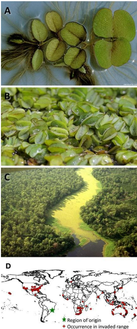
Fig. 2 a Close up of S. molesta , b free-floating aquatic group of salvinia, c floating mats of salvinia in Australia, d records of salvinia worldwide collected from a variety of databases including GBIF ( http://data.gbif.org ), CABI ( www.cabi.org/isc ), and IOBIS ( http://www.iobis.org )

aquatic organisms, drastically damaging these ecosystems over large areas (Fig. 2). In addition, dense mats of salvinia can impede water-based transport,