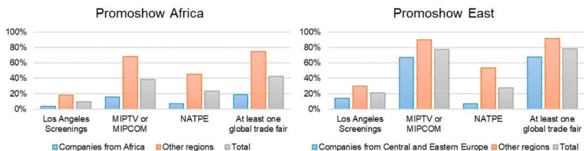
Figure 2. Percentages of 2011 attendees at Promoshow Africa and Promoshow East who also attended other global trade fairs in the television industry, in 2010 or 2011.

These events are not selected solely for the reason that they were organized by the same company. They are concretely polar cases in the sense that they represent different stages of the development of a trade fair. The variations between the two events allow us to study how attachment occurs in a new market, and how detachment occurs in a shrinking one.