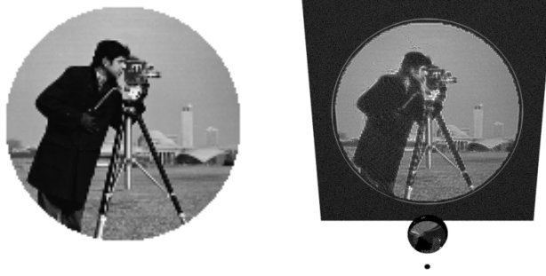
Figure 2: Left: target image. Right: simulation of the scene using the appleseed ® rendering engine; the small black disk at the bottom represents the light source.

We compute the second maximum in (20) using Theorem 1.2. We discretize the maximum in (25) over the set \{(\cos(k\pi/50), \sin(k\pi/50)) \mid k \in \{-50, \dots, 50\}\} ; however, for computing \sigma_{P(x)}(e) , which is itself defined as a supremum, we use a closed-form formula, see Appendix C.