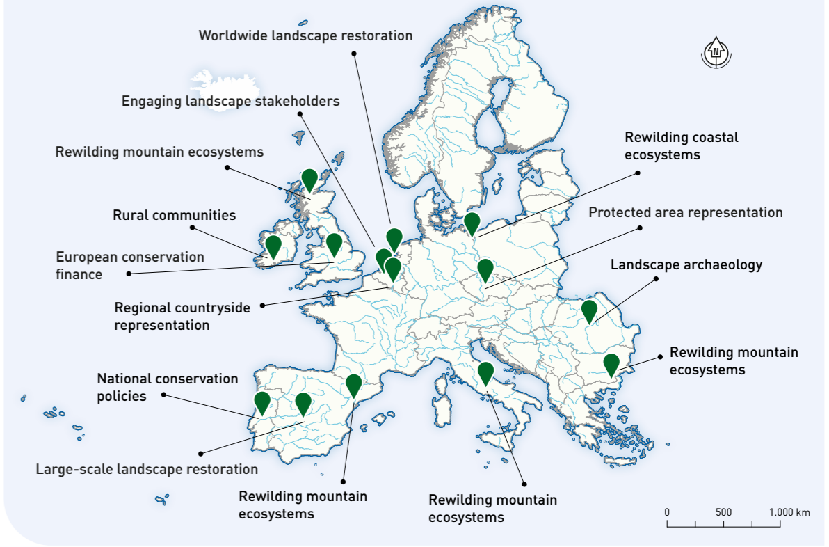
▲ Fig. 1. Location map of the stakeholders who participated in the workshop indicated with general theme of expertise.

invited practitioners worked in various aspects of landscape management, thus supporting our aim to represent transdisciplinarity and its impacts on the co-production of knowledge. With the workshop, we wanted to learn from the practitioners' expertise, particularly in relation to two questions: (1) What are the main research gaps that need to be improved in future research?, and (2) how could the TERRANOVA consortium help to fill in these gaps and challenges?