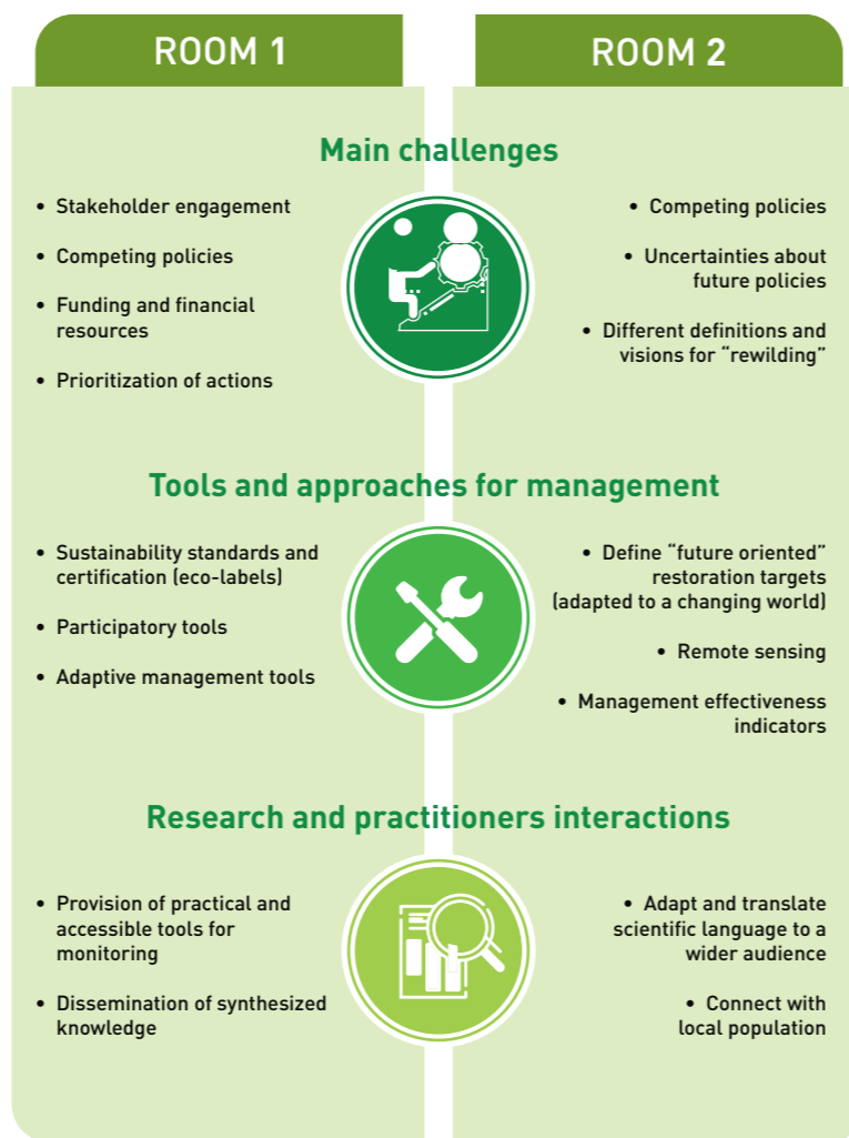
▲ Fig.2. Highlights of the discussions in each working group.

The following subsections present the highlights from the discussions in the two breakout rooms. Figure 2 details the different elements raised in each room.