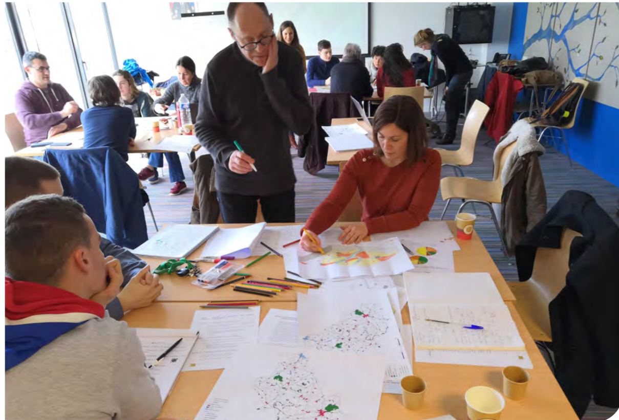
▲ Participatory meeting aiming at co-constructing narratives of the Couesnon watershed (France - N 48.41 W 1.36) for 2050.

set of three to four open questions to guide the discussions. We opted for open questions to encourage them to freely reflect on their own practices and to promote critical thinking. After the completion of the three moments, the main findings from each working group were shared with all the participants and they were invited to reflect on the results from their working groups.