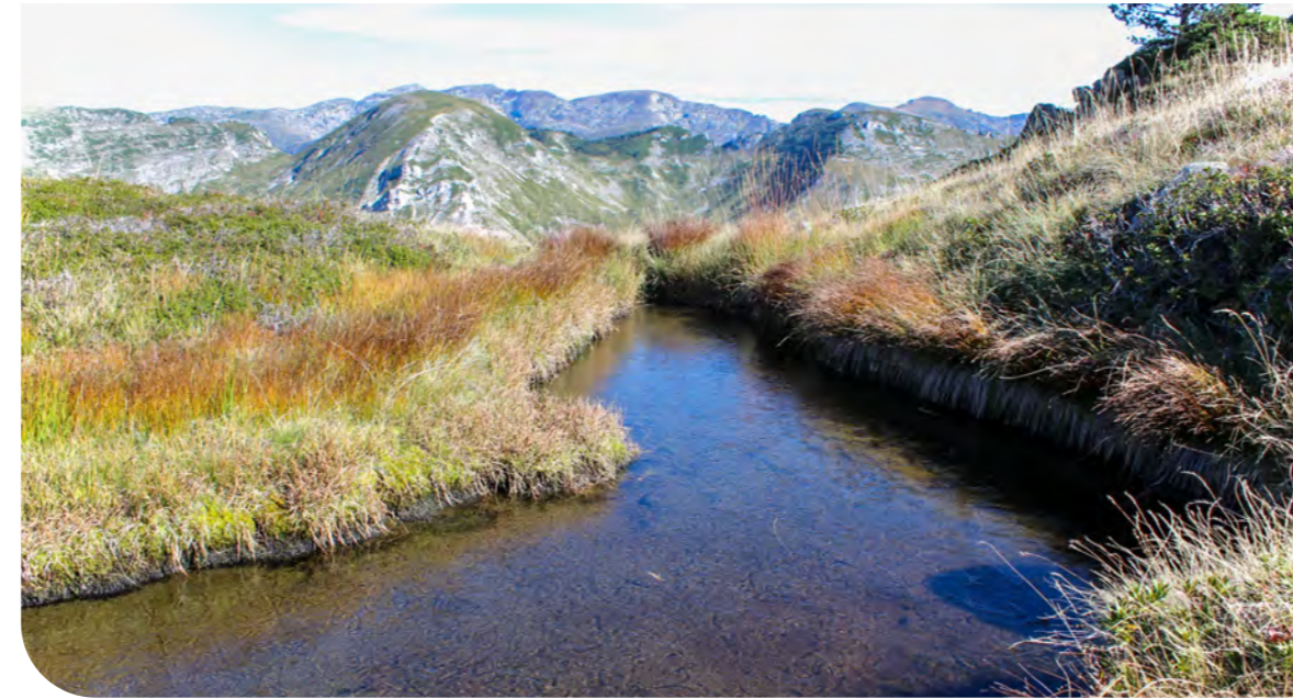
▼ @ Thomas Houet Small wetland in the French Pyrenees - Bassiès Valley (N 42.76 E 1.41)

To produce exploitable knowledge for policymakers and the general public, it is crucial to take full advantage of past landscape management experiences and understand the factors that determine whether the scientific knowledge is successfully used to influence landscape management strategies. Stakeholders' expertise are, in this context, essential to: (1) understand which are the barriers limiting the flow of knowledge, competences, opinions between researchers and stakeholders, and (2) highlight the different impacts of the research (instrumental, political or cognitive impacts 13 ) and possible ways of dealing with them.