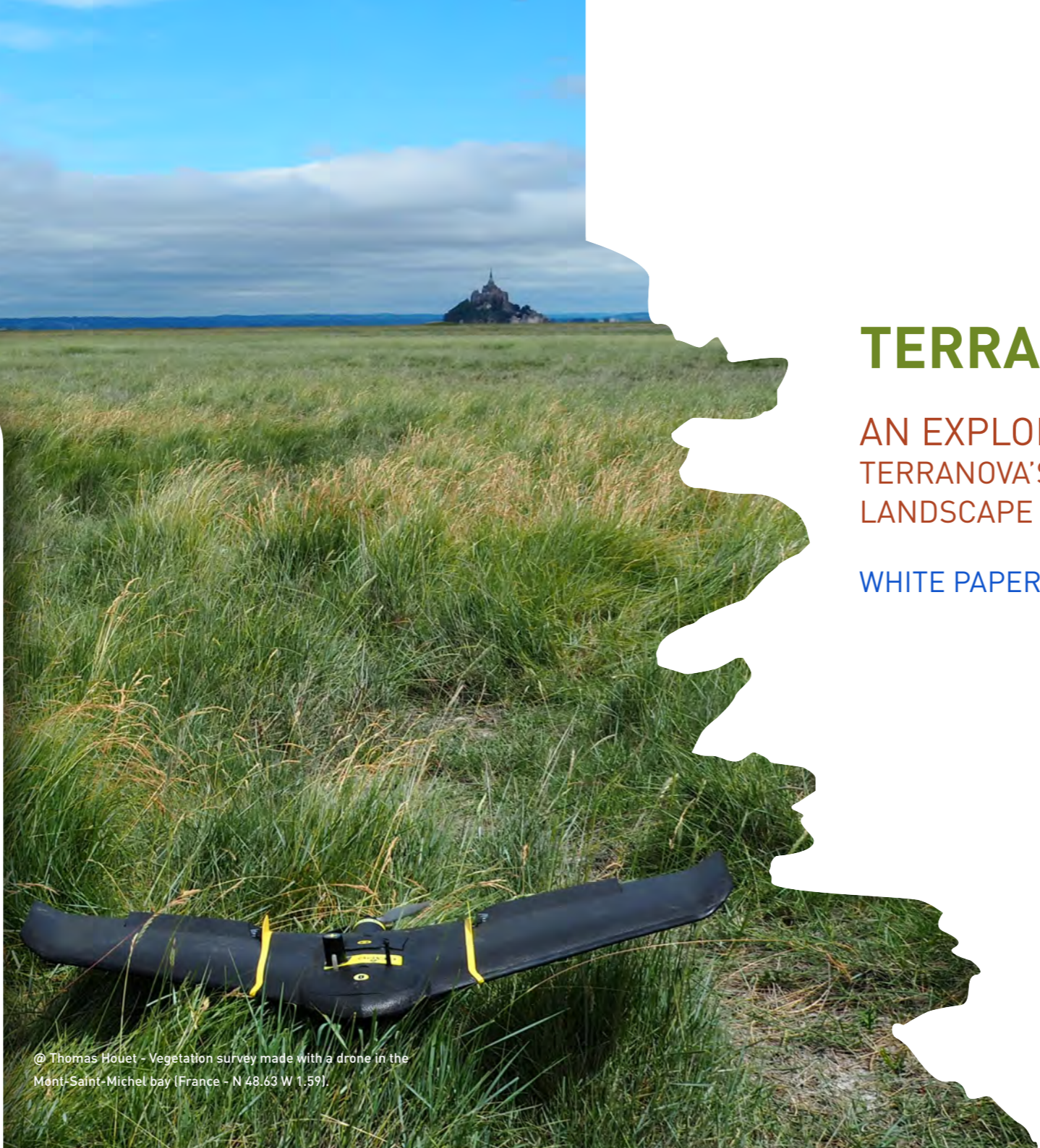
Vegetation survey made with a drone in the Mont-Saint-Michel bay (France - N 48.63 W 1.59).