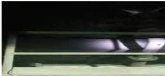
Fig.1.3: JSW Coke ovens Vibro-Feeder line inner view

As per the coke dry quenching knowledge is concerned, due to paucity of discharging facility in Vibro feeder line the recurrent tribulations will be occurred, which leads to stoppage of production and reduces the productivity of the system. So, in this esteem, it is needed to modify the system in a decorous manner by keeping all the required constraints in a common platform. So, in a present existing Vibro feeder line, there are some innovative modifications have made to overcome such problem. These detailed modifications have expounded in impending section.