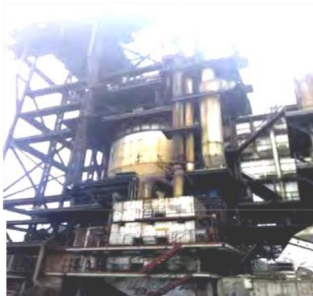
Fig.1.1: JSW Coke ovens of CDQ3&4

As far the requirements, the Jindal Steel Work Ltd. (J.S.W) has four numbers of coke dry quenching units (CDQ), and the coke dry quenching in JSW it is more advanced, it is possessing reliable technology to obtain metallurgical coke.