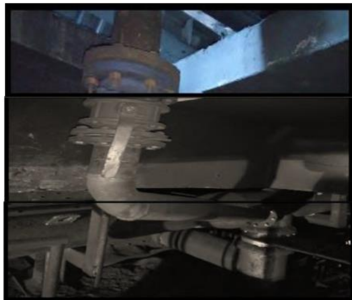
Fig.1.5: Physical Setup of Vibro feeder line

Fig.1.5 shows the physical setup of Vibro feeder line, in which angle of connecting pipe has wholly increased thereby reducing the damage of feeder line pipe as well as enhanced the smooth flow of dust into the de dusting chamber.