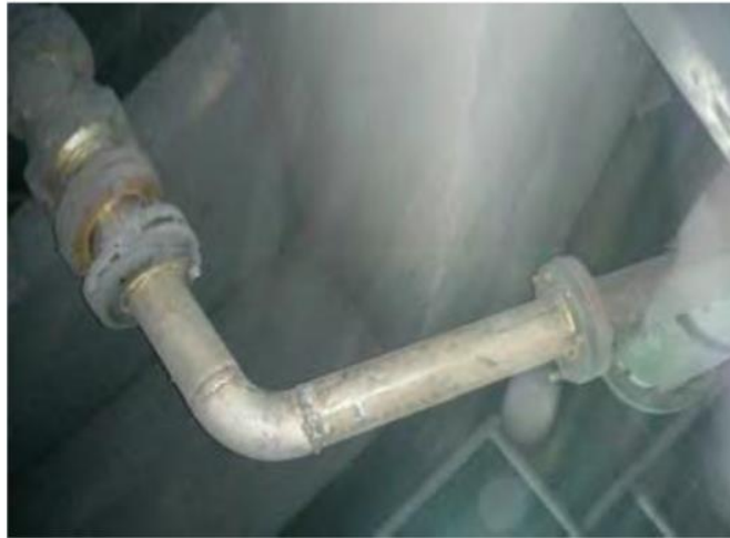
Fig.1.2: JSW Coke ovens Vibro-Feeder line