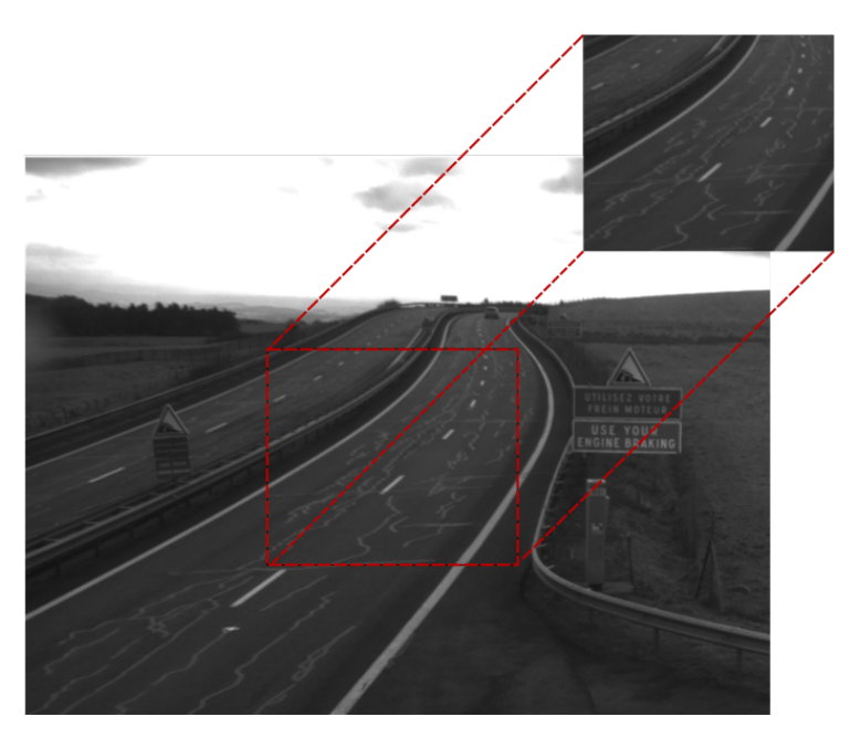
Figure 3. Example of fixed scene extracted from an image center, which belongs to the Cerema-AWH database.