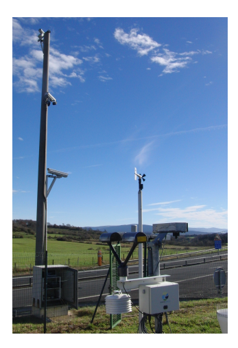
Figure 2. The recording station at the Col de la Fageole (A75 highway, France). The site is instrumented with a camera and weather sensors.

Upon completing the image acquisition phase, the data were automatically labelled by associating each image with the corresponding weather data. In this study, the snow case is not addressed. The used database contains over 195,000 images covering five weather conditions, distributed as indicated in Table 3: day normal condition (DNC), day light fog (DF1), day heavy fog (DF2), day light rain (DR1) and day heavy rain (DR2). To avoid introducing bias into the results while training and testing the algorithm, images acquired during even days were used first to train the algorithm, then images acquired during odd days were used for the test. Dividing up the database in this way ensures that similar images are not used for the training and testing phases, which may otherwise have introduced severe bias into the results.