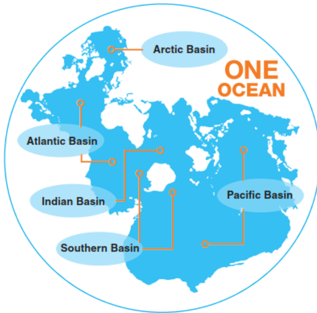
Figure 1. There is only one ocean. The ocean is an immense interconnected and heterogeneous whole that provides immeasurable benefits to humanity and the planet.