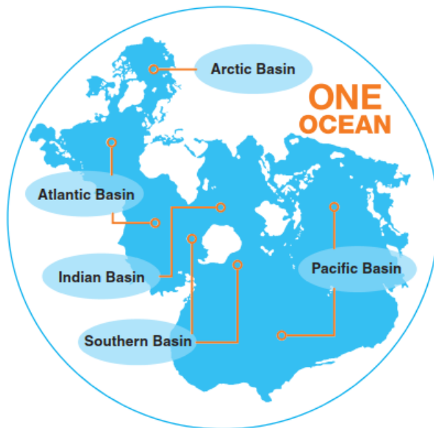
Figure 1. There is only one ocean. The ocean is an immense interconnected and heterogeneous whole that provides immeasurable benefits to humanity and the planet.