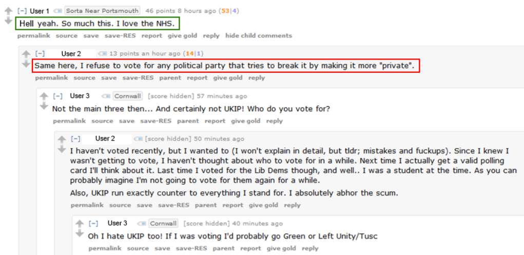
Figure 1: Part of a discussion tree from Reddit where users discuss United Kingdom politics.

Online discussion forums (Figure 1) typically manifest into tree-like structures that are reminiscent of argument trees. Whilst these discussion forums contain a wealth of information related to people’s opinions they also include implicit argumentation information. However unlike argument trees any relationship between posts in a discussion tree remains implicit. In recent years there has been considerable interest in harnessing opinionated knowledge that is buried in discussion forums in a variety of domains (e.g. retail, health and politics). However to-date the main focus of opinion mining has been on generating and applying sentiment lexicons or developing supervised learning algorithms that pay little to no regard to the underlying role of implicit information contained in the conversation between users.