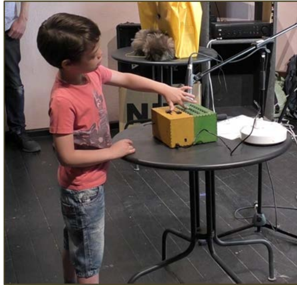
Figure 7. The instrument “Christiano Ronaldo” consists of a wooden box with three rows of eight soft rubber buttons and two sliders. The image is used with permission.