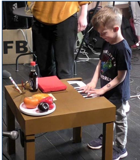
Figure 3. Playing the keyboard interface of the “I pour soy in the piano” instrument. On the table is also a soy bottle on a pressure sensor and a rectangular cushion with hidden buttons for drumming; the other items on the table were props. The image is used with permission.

would, depending on the amount of soy left, control the playback and sound level of a Japanese-themed music soundtrack. The design instruction of pouring soy into the piano was thus abandoned, to the child’s expressed disappointment, but the soy bottle feature was kept. A large padded cushion on the table surface with integrated buttons could be pressed to produce drum-like sound samples and was intended to support the suggested “a dog digging a hole in the ground” gesture.