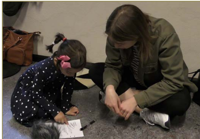
Figure 1. A child describing the pipes of her imagined pan flute-like instrument to the student through drawings during the workshop interview. The final version of the instrument is shown in Figure 6. The image is used with permission.

resorted to vocally sketching themselves in order to encourage the child to behave similarly. Other students gave examples or other suggestions to which the child could respond and react.