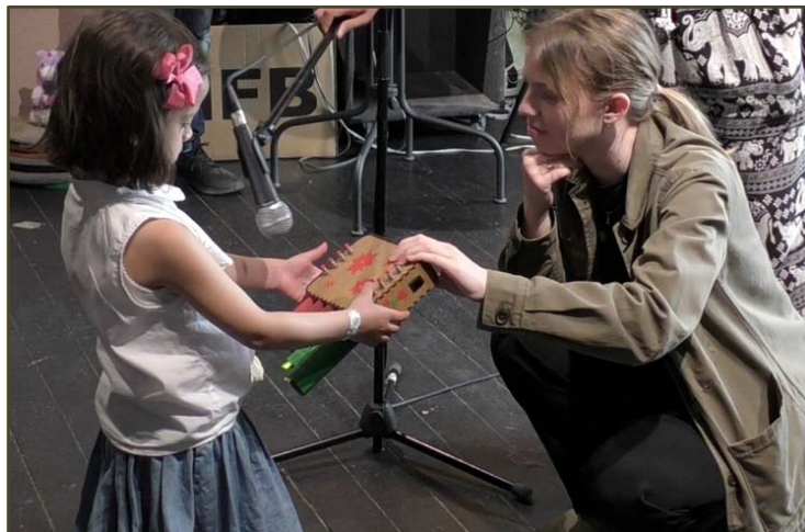
Figure 6. The instrument “Jomão” has a pan flute-imitating appearance and consists of a button interface. LED lights in red and green indicate which tones that are being played. The photo shows the instrument during the presentation with a microphone to project the sound. The image is used with permission.

Played tones were visualized with red and green lights emitted from the otherwise only decorative pipes. In the students’ project report, they discussed how the design instruction of a pan flute conflicted with a wish to produce something novel. The liberty taken here was, for instance,