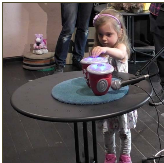
Figure 5. The “Maja” instrument is a repurposed toy drum with a piezo element and a pressure sensor below the drumheads. The drum lights up in blue or red according to which song is being played, and the lights also flash to accentuate the rhythm. The image is used with permission.

Drum instruments typically involve vivid body movements. However, the child did not approach the instrument as though it was a bongo drum. Instead, she kept a distance from the instrument, trying out one sound at a time with her left hand while pressing gently on the drumhead. The students did not try to move her closer to make it easier for her to use combinations of the sensors and controllers, and therefore, the embodied musical experience did not meet its full potential.