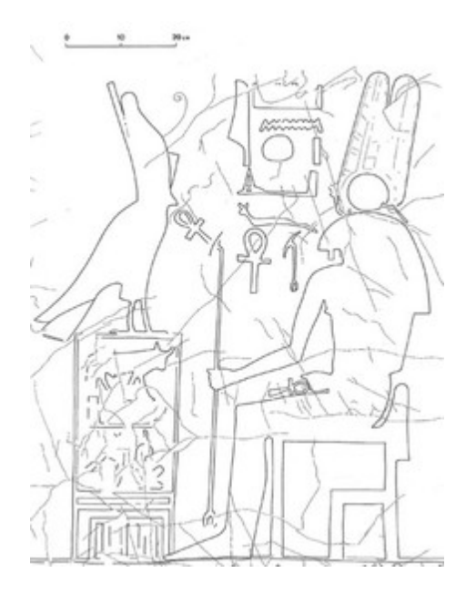
Figure 19.1 Ram-Headed Amun on the rock stela of Thutmose I at Kurgus (after Davies 2017:71, figs. 6 and 7.).

The most ancient exemplar of a ram-headed ("criocephalic") Amun in Nubia as well as in Egypt is carved on the sacred rock of Kurgus and dates to the reign of Thutmose I (Figs. 19.1–2) (Davies 2017:71, figs. 6–7). As the Nubian kingdom of Kerma was a society rooted in pastoralism (Bradley 2013; Emberling 2014; Doyen and Gabolde 2017), the existence of a Nubian ram-deity pre-existing the New Kingdom Egyptian conquest has occasionally been inferred from some other—in fact extremely scarce—clues (Wildung 1984:181–82; Kormysheva 2004:109; Török 2009:151–52), though, unlike bovids, ovicaprids were only rarely depicted in Nubian artistic productions (Kleinitz 2012:33).<sup>2</sup>