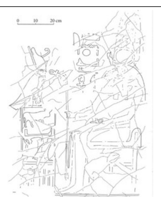
Figure 19.2 Ram-Headed Amun on the rock stela of Thutmose III at Kurgus (after Davies 2017:71, figs. 6 and 7. Courtesy Vivian Davies).

The clues remain fragile and fail to constitute a definite proof of a pre-existing ovine cult in Kush, though the possibility cannot be totally discarded. Indeed it would be quite plausible that the prevalence of ram-headed Amun in the land of Kush had resulted from the conjunction of Egyptian and Kushite religious traditions (Valbelle and Bonnet 2003:296–97) promoted by two peoples who, after tough fights, were keen to find common concepts in each other's cultures and beliefs.