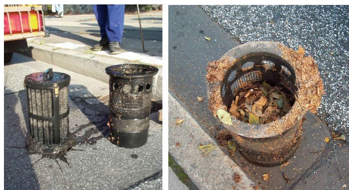
Figure 3 and 4 : INNOLET ® filter cartridges after one month inserted in the gully, right pictures shows the retention of leaves