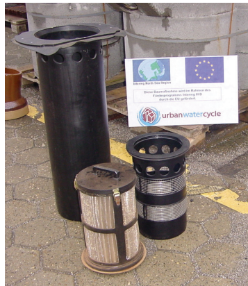
Figure 2 : INNOLET ® filter cartridges were implemented in "Mittlere Bille" catchment area, parts from the left: cartridge, filter filled with adsorptive material, retainment of larger particles like sand and leaves

One of the aims of the Hamburg UWC projects is the purification of storm water before running into the receiving water. One possibility is the treatment of the runoff at the source. Therefore, the innovative filtration system INNOLET ® , which can be applied to standard inlets, was selected for treatment in a road with high daily traffic load (more than 35.000 veh/d) in the project catchment of "Mittlere Bille". The road is one of the main through roads of the suburb of Hamburg Bergedorf. It is swept once a week by the public cleaning company.