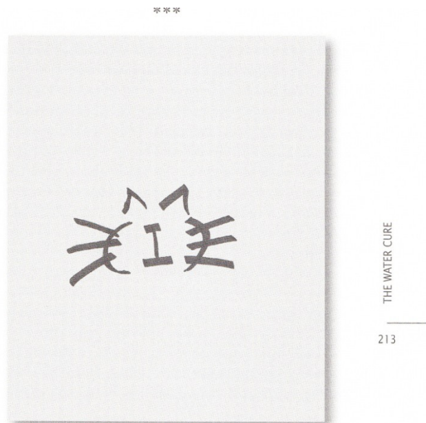
Fig2: The Water Cure , 213

“So we induce,” and the line progressively comes into view, first as two strokes ( WC , 21), then as a partial sketching ( WC , pp. 28, 48, 68, 84, 98, 112, 129, 146, 201) and ultimately as a Chestsire Cat [Fig 2]. If we chose to flip through the pages, and uncover the picture in the making, then, the first page bears “the entire picture,” it is its symptom fading in and out of focus. It is a streak, a line and a trace. Every line holds the entire picture.