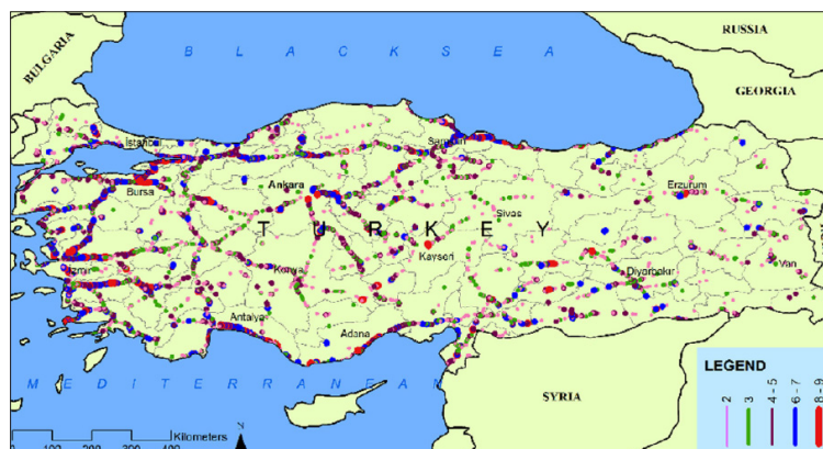
Figure 1 Traffic accident black spots determined by Negative Binomial regression method and the number of repeatability within the 9-year period.[12]

Every year, according to the WHO [10], 1.25 million people die on roads around the world. One of the most effective methodologies for improving traffic safety is the management of black spots [11]. This refers to the procedures for their determination and the taking of appropriate measures for their removal and preventive action for the future. GIS is a solution that will facilitate the collection and storage of data, as well as the process of analysis and determination of black spots on the basis of collected data. Using GIS, it is possible to identify and analyze critical road sections, to see the spatial distribution of hot spots, the dynamics of increasing/decreasing the number of accidents over time. GIS also enables the identification of the main causes of accidents in accordance with the collected attributes (information on the circumstances of the accident). It allows combining with other data from the database, and to determine the interdependence of the position of the black spots and other important objects on the map, as shown in Figure 1.