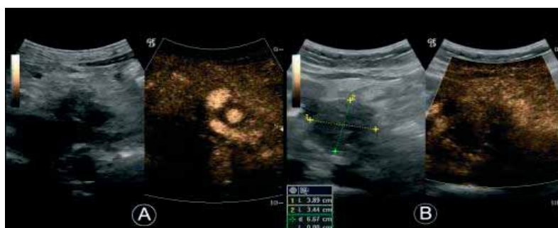
Fig. 1. Images captured in one of the first patients undergoing ultrasound sonoporation in combination with gemcitabine. The early arterial filling to the right of the main tumor can be seen in panel A (arrow). Panel B shows the dimensions of the primary hypoechoic tumor using the customized sonoporation treatment settings.

Ultrasound has been used for experimental delivery of therapeutic agents, including genetic material, protein and chemotherapeutic agents mixed with or even encapsulated in microbubbles. Exposure of these microbubbles to ultrasonography yields targeted delivery of therapeutics to specific anatomical locations or tumours. Our research group has demonstrated that lipid-shelled microbubbles can be forced to enter cells at low, diagnostic acoustic settings [Delalande 2011]. Combining ultrasound contrast agents with therapeutic substances may lead to a simple, straightforward and economic method to instantly increase drug uptake during ultrasonic imaging, using conventional echo machines.