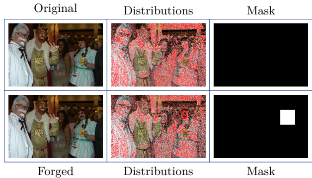
Fig. 1: Illustration of the approach. Left: two input images, one pristine and the other a forgery from the UMD face-swap dataset. Middle: the distribution of flat blocks (in white or red, containing only noise). Among them, the red ones are the flattest ones in each color bin. Right: the final forgery mask detects a non uniform distribution of the red blocks among the white ones.

This work was supported by a grant from Région Île-de-France.