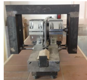
i) Plane/Plane Tribometer