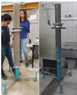
g) SLIPER Rheometer