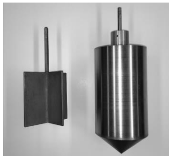
h) Interface tool for ICAR