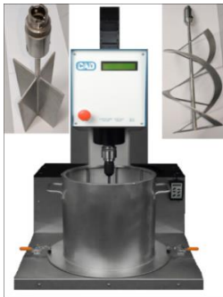
d) Rheocad Rheometer