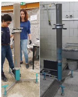
g) SLIPER Rheometer