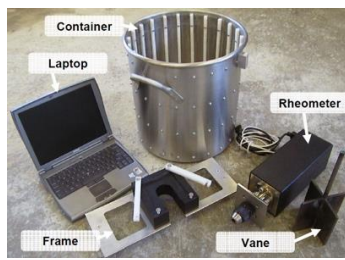
a) ICAR Rheometer