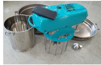
c) eBT-V Rheometer