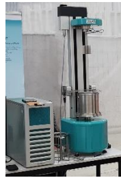
b) Viskomat XL Rheometer