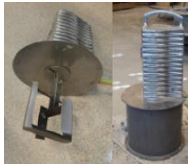
e) BML Rheometer 4SCC