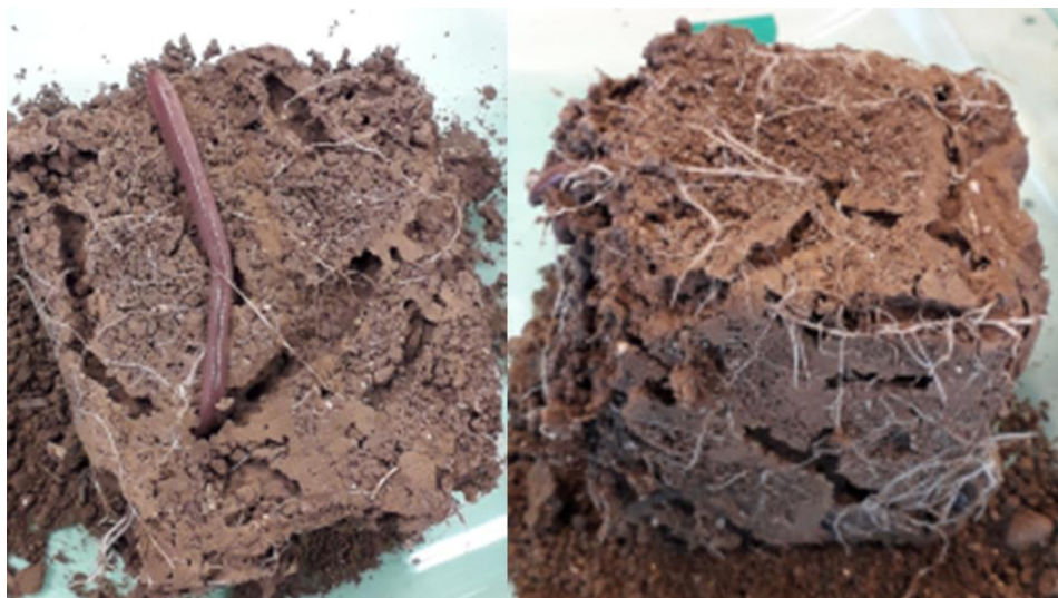
Figure 1. Representative pictures of soil collected in pots at the plant harvest illustrating the intense burrowing activity of earthworms.

At harvest, earthworm survival was 100% for all the treatments and their burrowing activity was clearly visible (Figure 1). In addition, their number and biomass per pot at the end of the experiment were not significantly ( p > 0.05 ) different from that before their incorporation into the soil. This indicates that frass had no toxic effect on earthworms and allows us to ascribe the following results to the actual presence of earthworms. The similar earthworm biomass between the beginning and the end of the experiment contrasts with Sizmur et al. [25] who found in a 12-week microcosm experiment a continuous decrease of earthworm ( L. terrestris ) biomass in soil with no amendment or with organic amendments including farmyard manure, anaerobic digestate, and compost. However, Sizmur et al. [25] carried out their experiment without plants, which could possibly explain the discrepancy with our study. Since L. terrestris may feed on plant roots [26,27], it is likely that, by providing an additional source of food, the presence of plants contributed to maintaining earthworm biomass all over the experiment.