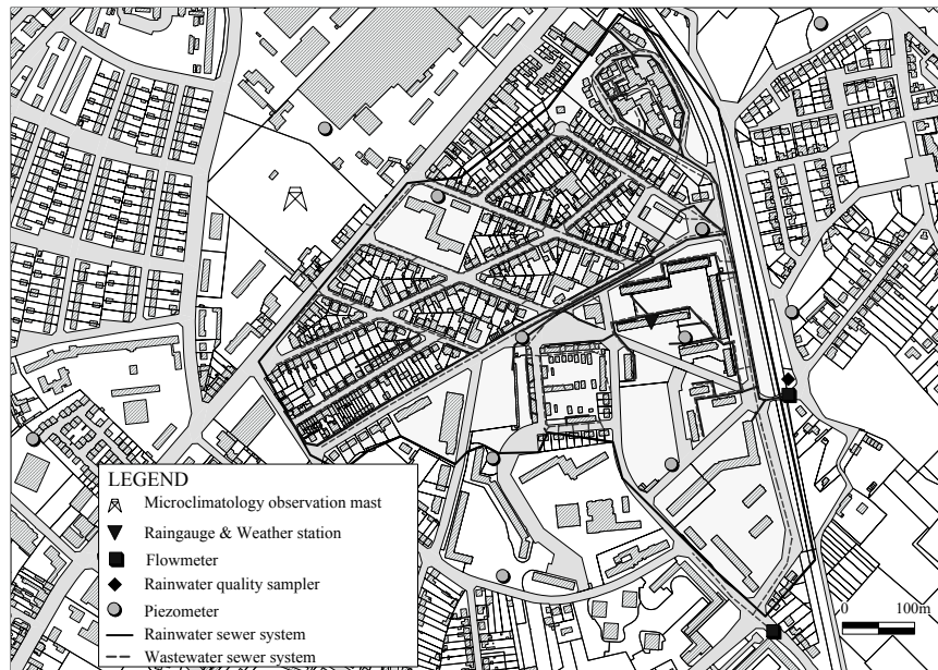
Figure 3. Instrumentation devices on the Pin sec watershed, delimited by the bold line

A continuous monitoring of the water table variations is possible thanks to 11 piezometers installed on and around the catchment (Fig.3). Pressure sensors located at the bottom of the wells allow a continuous observation of the water level with a time step of 20 minutes. The objective of this instrumentation consists in following the variations of the water table level due to meteorological forcing and to rain events. The spatial variability of the soil saturation level can be deduced from this set of data, and the main groundwater fluxes may be obtained. This kind of data is needed for the determination of a whole water quantitative balance on this specific zone. The groundwater characteristics of the soil are also measured, a special measurement site is equipped with water content sensors and tensiometers to estimate both soil moisture and hydric potential.