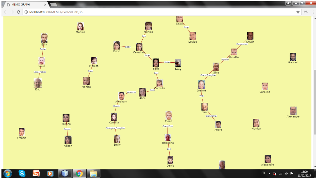
Fig. 2. Screenshot of Memo Graph showing the visualization of a small-scale Linked Data dataset using the PersonLink vocabulary.