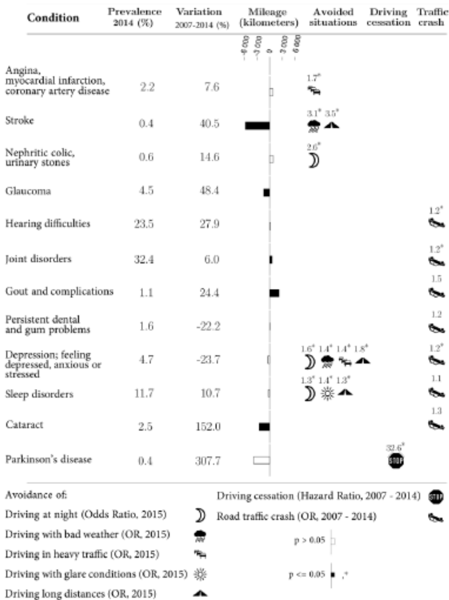
Figure 2 Effects of chronic disorders on mileage, avoidance of specific driving situations (multivariable cross-sectional analyses, 2015), driving cessation and road traffic crash (multivariable longitudinal analyses, 2007–2014). The chronic disorders shown were associated ( p \leq 0.05 ) with the avoidance of at least one specific driving situation, or with road traffic crash ( p \leq 0.20 ).