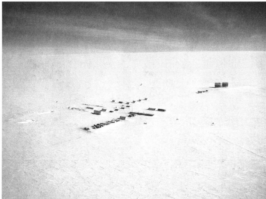
Fig. 1. An overview of the Dome C summer camp. Original color image appears at the back of this volume.

The summer camp at Dome C (Figure 1) is a collection of buildings housing up to 50 people for 10–12 weeks each summer. It forms a surprisingly cozy “international village,” supplied by Twin Otter aircraft originating from the Italian Terra Nova Bay coastal station, and by tractor trains that make three round trips each year. The latter carry heavy equipment from the French Dumont d'Urville station, 1100 km away. Some of the summer personnel are engaged in constructing a new year-round station, Concordia, that will be operated by French and Italian Antarctic organizations as only the third inland Antarctic permanent station (after the U.S. Amundsen-Scott station at South Pole, and the Russian Vostok station).