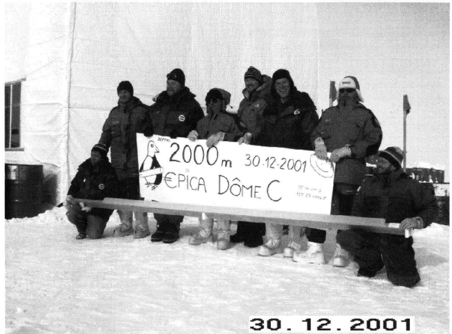
Fig. 2. The EPICA Dome C drilling team shows off the core from 2000-m depth. Original color image appears at the back of this volume.

Assuming that our tentative dating is confirmed by future data, then the ice at the current drill depth (2864 m) is 530,000 years old. The useable Vostok record extends to the middle of MIS 11 (below that, the meteoric ice containing a climatic record gives way to refrozen ice from the underlying lake [Jouzel et al. , 1999]). The EPICA Dome C core is therefore already the oldest sequence of ice brought to the