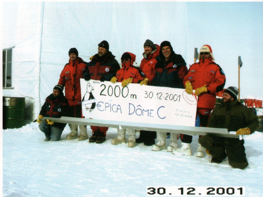
Fig. 2. The EPICA Dome C drilling team shows off the core from 2000-m depth.