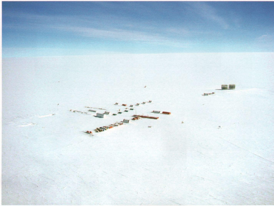
Fig. 1. An overview of the Dome C summer camp.