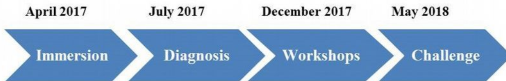
Figure 1: Four methodological protocol periods

goal of supporting changes in daily mobility practices.