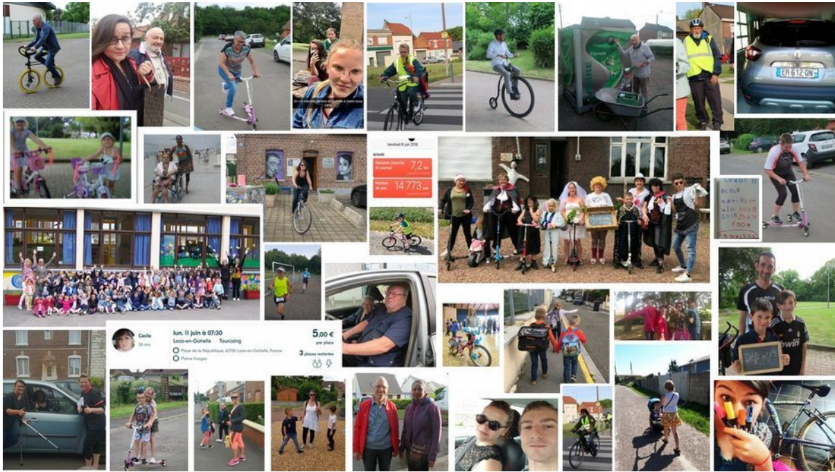
Figure 3: Examples of pictures sent by the participants once they had completed their challenge(s) in the MobiLoos Challenge