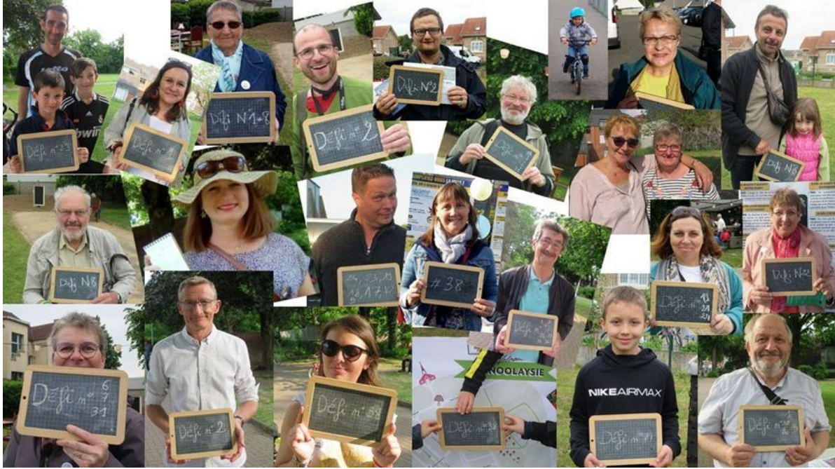
Figure 2: People engaged in the MobiLoos Challenge photographed with the number of their chosen challenge(s)