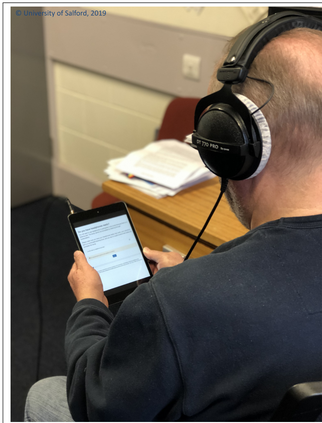
Figure 1. The listener will listen at home to speech signals transmitted via a tablet and headphones.

that employ low-latency wireless technology.