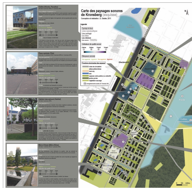
Figure 2. Map of Kronsberg’s soundscapes [9].

The map of the soundscapes of the Kronsberg's neighbourhood in Hanover, Germany, (Fig. 3) was created as part of a doctoral research on the development of a method for qualifying the soundscapes of German sustainable neighbourhoods (Kronsberg in Hanover and Vauban in Freiburg in Brisgau, [9-10]).