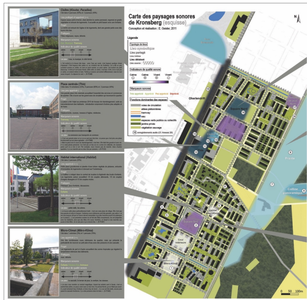
Figure 2. Map of Kronsberg's soundscapes [9].

The map of the soundscapes of the Kronsberg's neighbourhood in Hanover, Germany, (Fig. 3) was created as part of a doctoral research on the development of a method for qualifying the soundscapes of German sustainable neighbourhoods (Kronsberg in Hanover and Vauban in Freiburg in Brisgau, [9-10]).