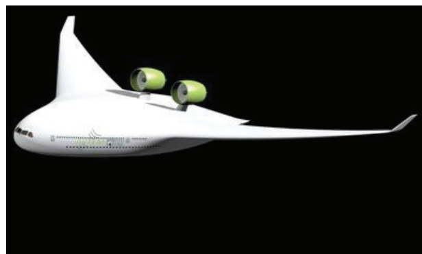
Figure 4. BOLT blended-wing aircraft 3D model, developed in EU ARTEM project by ROMA TRE University.

After working on the validity of the virtual reality tool in laboratory, an in situ experiment will be organised in a city around an airport where an operational change of the aircraft route is planned. If people feel that they understand their environment and the influence of airport operations upon it, in theory they should feel in more control and thus more able to cope with change. The hypothesis behind this experiment is that the noise annoyance could be reduced