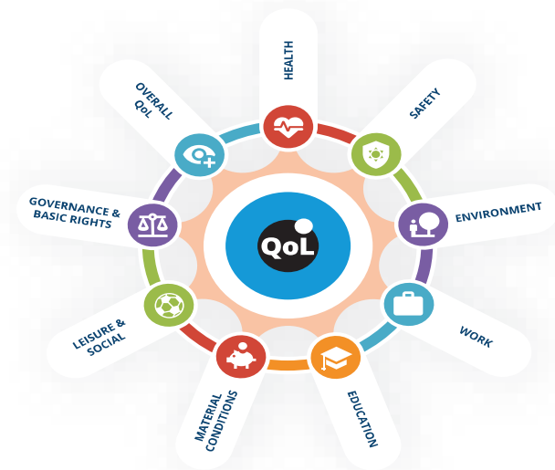
Figure 1. Overview of Quality of Life indicators

This activity could then inform the development of a QoL Strategy with defined activities, evaluation processes,