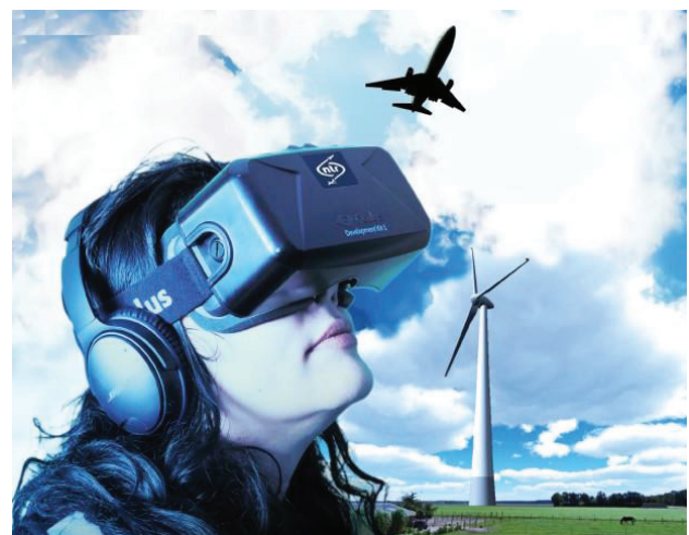
Figure 2. The Virtual Community Noise Simulator of NLR.

Amongst novel approaches that could enhance the communication between local planners and communities around airports, there are some virtual reality tools (auralisation and visualisation) which can be used by residents to give them better understanding of the impact of future airport scenarios in land-use planning, as the virtual reality creates a higher immersion for the user, See Figure 2. Such tools have proven to be convincing in