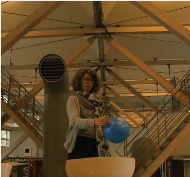
Figure 6. Reverberation balloon test of, ENSA Lyon, Laboratoire des Ambiances 2016

Knowing a room reverberation usually done with graphics that only acousticians can decrypt; however, architecture is a collective production. So, how can we share this knowledge if we want her to interact before project, during the diagnostic and design phases developed by the architects?