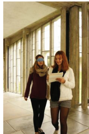
Figure 1. Blindwalking, convent of la Tourette, 2015.

If there is one area where the acoustic method has proved its worth, it is indisputable that hearing is to pedagogy what painting owes to sight.