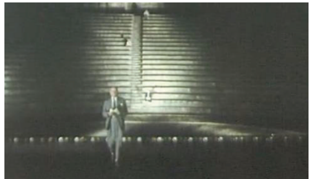
Figure 5. Voice test Orange theatre, Canac, 1966.

only with an audio recording that broadcasts on speakers allows to compare the results from an identical sentence: «the physicists and architects of antiquity had only two means: geometry and ear». This "test sentence" is the main methodological hypothesis of the acoustician who was thus able to validate intelligibility and understanding (logatons) measures, using this high reliability experimental method.