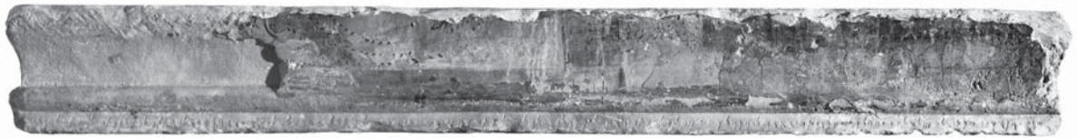
FIG. 3. Phoenician royal dedication to Anat, Idalion (courtesy of the Department of Antiquities, Cyprus).

There are two outstanding exceptions: Reshef (that is constantly rendered as Apollo) and Anat (constantly rendered as Athena). The case of the two deities raises interesting remarks. Both are Canaanite deities, rather than Phoenician deities. Reshef is barely attested in the first millennium in the Levant, except as part of a toponym of Sidon. 52 Anat (whose importance in the second millennium is highlighted in Ugaritic texts) is also conspicuously absent, except as the double deity Anat-Bethel, mentioned among other gods in the 7th century BCE treaty concluded between Tyre and Assyria. 53 Both are remarkably well attested in first millennium Cyprus (FIG. 3). Iacovou relies on this evidence to suggest that at least part of the Phoenician population of first millennium Cyprus are the descendant of Canaanites who settled in the island in the 12th century BCE. 54 One may perhaps also suggest that both deities were local Cypriot deities that were in an early phase of intercultural contacts translated/interpreted as Reshef and Anat in the Semitic language, as Apollo and Athena in the Greek one.