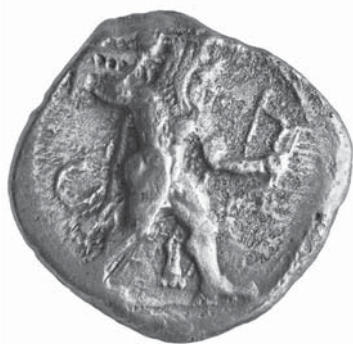
FIG. 2. Silver siglos of king Baalmilk I, Kition.

Phoenician deities are usually the same throughout the whole island. They are major deities of the Phoenician pantheon: Melqart, Eshmun, 40 Ashtart, Baal. As noticed above, most personal names are theophoric names derived from these deities' names. There are some remarkable exceptions. Mikal (more often in the double form Reshef-Mikal) is only known at Kition and Idalion. 41 Its very existence has been doubted. 42 The ongoing study of the Idalion archive definitely proves the existence of the god. 43 It also highlights its importance as one of the main gods of Kition, presumably intimately linked to royal power. Remarkably, this divine name does not seem to have left a strong imprint on anthroponomy. 44 We find at Larnaca-tis Lapithou, among a list of other dedications made by Param to Melqart, Osiris and Ashtart, a dedication to "the gods of Byblos that are at Lapethos". 45 This is an isolated and surprising reference, which can be compared with linguistic affinities mentioned above.