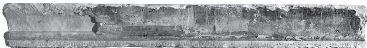
FIG. 3. Phoenician royal dedication to Anat, Idalion.

There are two outstanding exceptions: Reshef (that is constantly rendered as Apollo) and Anat (constantly rendered as Athena). The case of the two deities raises interesting remarks. Both are Canaanite deities, rather than Phoenician deities. Reshef is barely attested in the first millennium in the Levant, except as part of a toponym of Sidon. 52 Anat (whose importance in the second millennium is highlighted in Ugaritic texts) is also conspicuously absent, except as the double deity Anat-Bethel, mentioned among other gods in the 7th century BCE treaty concluded between Tyre and Assyria. 53 Both are remarkably well attested in first millennium Cyprus (FIG. 3). Iacovou relies on this evidence to suggest that at least part of the Phoenician population of first millennium Cyprus are the descendant of Canaanites who settled in the island in the 12th century BCE. 54 One may perhaps also suggest that both deities were local Cypriot deities that were in an early phase of intercultural contacts translated/interpreted as Reshef and Anat in the Semitic language, as Apollo and Athena in the Greek one.