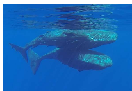
Figure 2. Sperm whale social interaction