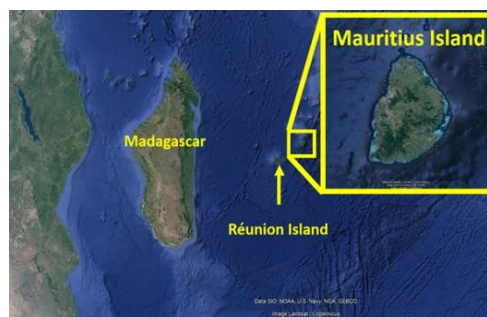
Figure 1. Mauritius Island, Indian Ocean

results was to fully describe contact interactions, confirming the importance of these contacts for this haptic species.