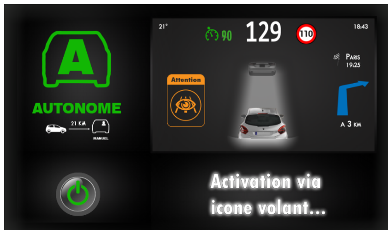
Fig. 2. Final designed HMI.

The HMI specifications were defined using the "five W method": What, Where, hoW, When and Who. Regarding the type of information to be displayed on the interface (What to display?), five groups were defined: the activation command (button), the driving mode indicator, the information contributing to a good "situational awareness", GPS navigation, and alert messages. To facilitate the understanding and urgency of the messages by the driver, a color code was defined. The fifth question, "Who?", aimed to identify the conditions for the HMI content evolution. The driver monitoring module diagnosed the driver's condition based on indicators related to his/her visual strategies, posture, and internal state described above. It also identified the driver's actions (e.g., resume a driving posture by putting the hands on the steering