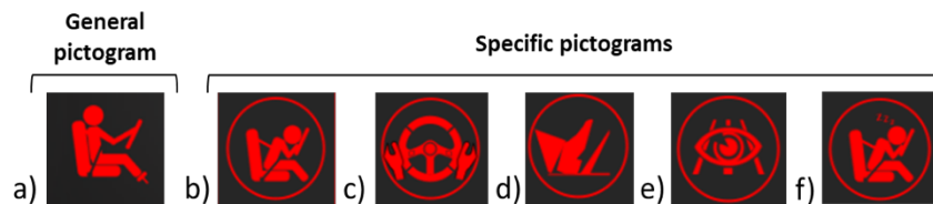
Fig. 4. General and specific pictograms about driver state.

Concerning the monitoring feedback, the visual and auditory combination was elicited by 44% of the participants. Most of them signaled that the visual modality would not be useful by itself in case of drowsiness or inattention to the HMI. However, 27.9% of the participants preferred the single visual mode because they considered it less aggressive and less disturbing to the other passengers (e.g., sleeping children). Besides, they were asked about their preferences regarding the pictogram type associated with the driver's state. They were shown and could decide between a general red pictogram ("improper driver state", see Fig. 4a) or specific red pictogram informing about an improper posture (Fig. 4b), hands-off (Fig. 4c), foot-off (Fig. 4d), eyes-off (Fig. 4e), and drowsiness (Fig. 4f).