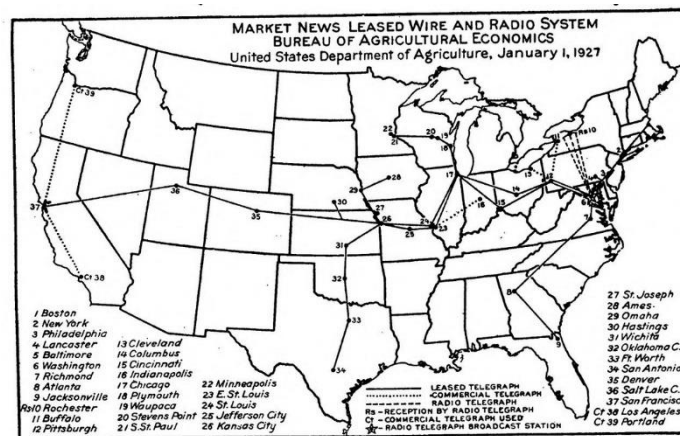
FIG. 195.—Location of stations having the market news service of the Bureau of Agricultural Economics

In the early 1920s, the radio network was mostly established in the North and East of the country. Other regions (e.g., Nebraska, Kansas, South Dakota, Iowa, Oklahoma) were beyond the range of the existing telegraph and radio network. In the following years, the radio network expanded to central and western regions (see Figure 1). The USDA claimed in 1926 that its reports were broadcast on more than 80 radio stations (USDA 1927: 624). The USDA also advocated the use of radio in farms. The results of their surveys showed an estimate of 145,000 radio sets on farms in 1923, 365,000 in 1924, and more than 553,000 in 1925—there were around 6,500,000 farms in the country in the early 1920s.