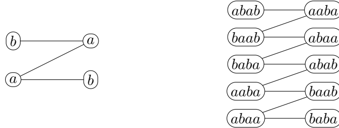
Figure 1: The graphs of E(\varepsilon) (on the left) and E_{4,4}(\varepsilon) (on the right).

The extension graph E(\varepsilon) and the generalized uniform extension graph E_{4,4}(\varepsilon) of the empty word are represented in Figure 1.