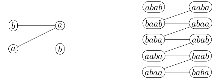
Figure 1: The graphs of E(\varepsilon) (on the left) and E_{4,4}(\varepsilon) (on the right).

The extension graph E(\varepsilon) and the generalized uniform extension graph E_{4,4}(\varepsilon) of the empty word are represented in Figure 1.