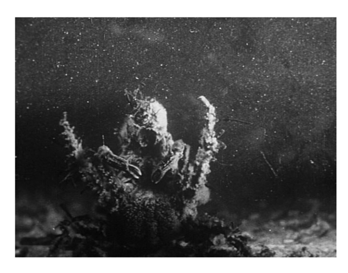
Still from Jean Painlevé, Hyas et Sténorinques, 1928, 35 mm, N/B, 9mn.

In conclusion, there are strong indications that Painlevé's documentary films influenced, if not directly inspired, Eisenstein's idea of protoplasmaticity, understood as a continuing metamorphosis and montage of all forms, from the most basic to the most complex, from unicellular organisms to man. As Oksana Bulgakowa points out in the afterword to Eisenstein's notes on Disney: 'He [Eisenstein] saw the grounds of Disney's effect in the (utopian) promise of freedom from ossified form, which allows for a state of eternal flux and becoming, and a freedom in the relationship between man and nature. [...] Art could thus be considered an anthropological necessity.'37