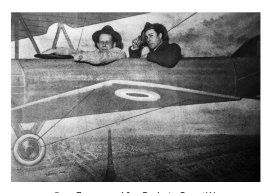
Sergei Eisenstein and Jean Painlevé in Paris, 1930.

Painlevé also took Eisenstein on a grand tour of Paris, to the Palais Royal square and to the Comédie-Française. Of this tour, Painlevé would later recall: 'I also took him to the Cigale theatre to see an exceptional American film Red Christmas. Afterward, we wandered around the Clichy fairgrounds ... and had our photo taken in a mock airplane.'23