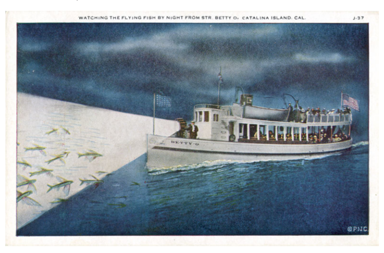
Postcard from Sergei Eisenstein to Jean Painlevé, Catalina Island, undated.

In another, from Catalina Island, Eisenstein perhaps makes an allusion to Painlevé's underwater fauna; with the usual humour that imbued all of their correspondence, he wrote: Voici encore un tas de sales bêtes pour en faire des films' (Here again are some foul creatures to make films of).