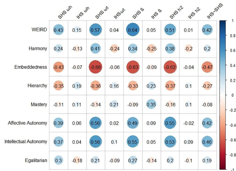
Fig 3. Country level correlations between subjective country level variables and happiness variable reliabilities. Note. IHS = Interdependent Happiness Scale, SHS = Subjective Happiness Scale, \omega_t = total common variance, \omega_h = general factor saturation, \beta = smallest split half reliability, h^2 = average communality score. WEIRD scores originally from Muthukrishna et al. [37], values scores originally from Schwartz [38].

https://doi.org/10.1371/journal.pone.0242718.g003