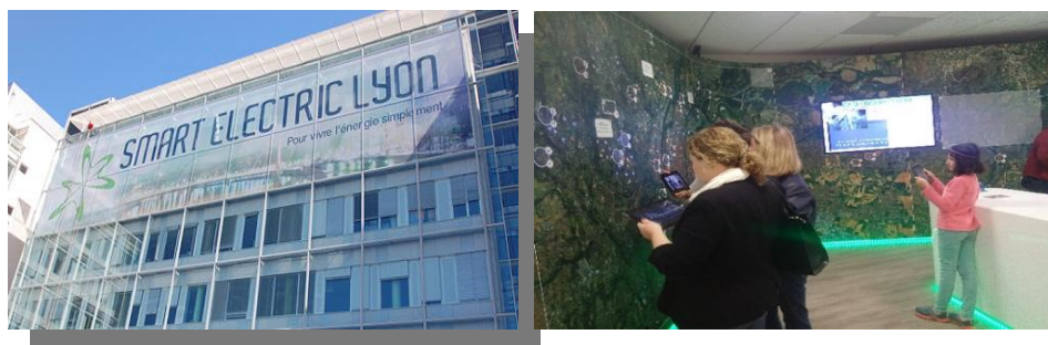
Fig. 3: The Showroom of SEL and the activities inside the showroom

The SEL project was formalized by the creation of a consortium named after the project, the 'Consortium of Smart Electric Lyon. Around twenty members of different actors from energy sector, home appliance producer, and home smart connected devices are invited to perform their programs or to test their latest products to connect to Linky. In the following figure 3, the building of Smart Electric Lyon Experiment Showroom where the citizen could visit and gather information about Smart Electric Lyon as Smart city visualization.