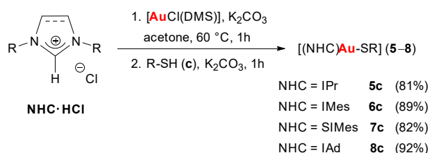
Scheme 2. One-pot synthesis of gold-NHC thiolato complexes

With the aim of further simplifying the synthetic procedure to gold-NHC thiolates, we tested the direct conversion of the azolium salts (NHC-HCl), which are the classical precursors of NHC ligands, into the desired complexes. Gratifyingly, by first reacting the azolium salt with the [AuCl(DMS)] precursor in the presence of K 2 CO 3 (1 equiv.) for 1h in acetone at 60 °C and subsequently adding 1-thio- \alpha -D-mannose tetraacetate ( c ) as a representative thiosugar and an additional equivalent of base, it was possible to obtain the final complexes in yields comparable to the two-step process (Scheme 2).