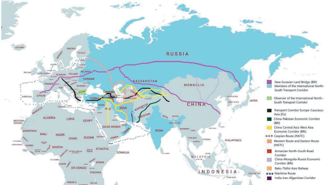
Map 3. INSTC and other Eurasian Corridors 105

India became a member of the SCO in 2017, which provides it with an opportunity to defend its economic, political and security interests in Central Asia. In turn, the Central Asian countries can use Indian influence to manoeuvre Russia, Pakistan and China. Within the framework of India-Central Asia Dialogue, the meeting of foreign ministers of India, Kazakhstan, Tajikistan, Turkmenistan, Uzbekistan, and Kyrgyzstan took place in 2020, in which all the countries decided to cooperate in the fight against COVID-19.