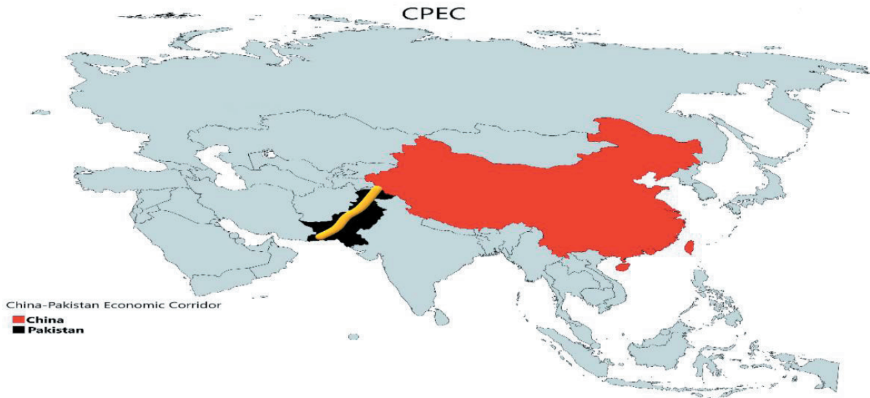
Map 4. China-Pakistan Economic Corridor