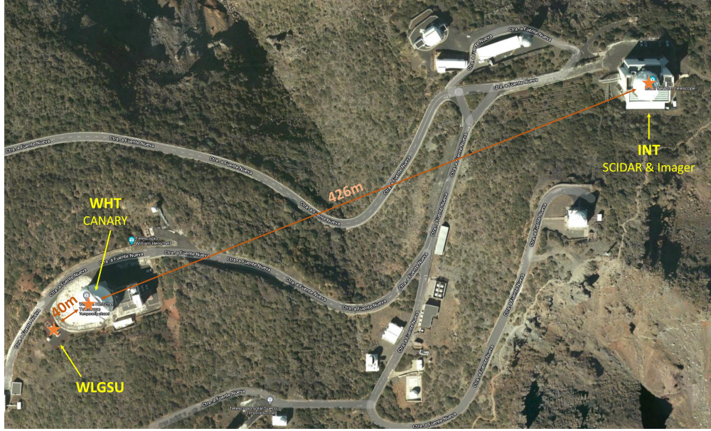
Figure 1. Plan view of observatory site showing locations of telescopes that host facilities offered through the ORP on-sky access program.