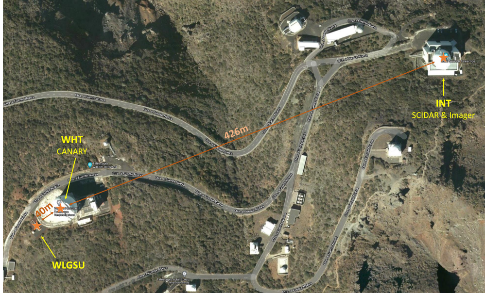
Figure 1. Plan view of observatory site showing locations of telescopes that host facilities offered through the ORP on-sky access program.