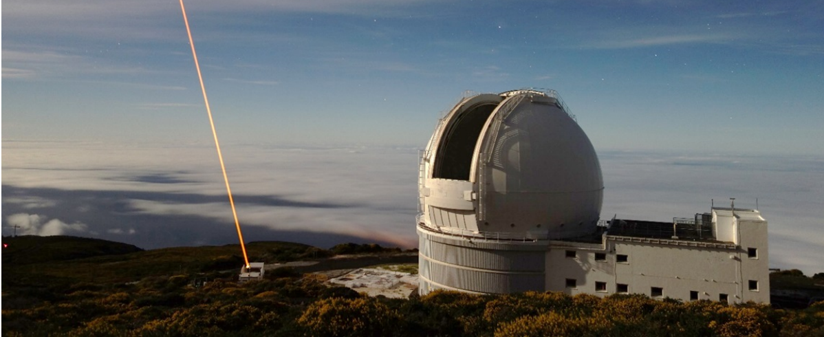
Figure 3. 'Wendelstein' Laser Guide Star Unit and William Herschel Telescope