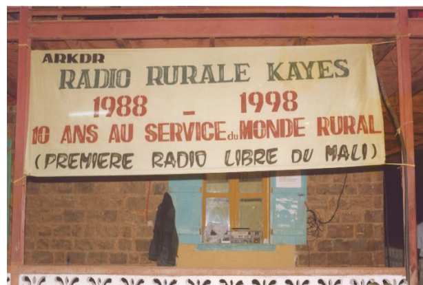
Fig. 2. Picture of a banner at the entrance to Radio Rurale de Kayes on the occasion of its tenth anniversary, 1998.

'Radio Rurale de Kayes' — this seemingly plain denomination was in keeping with the station's declared function as a medium dedicated to rural audiences focusing on development issues. However, in hindsight RRK also became known as the first radio libre in Mali (Fig. 2).