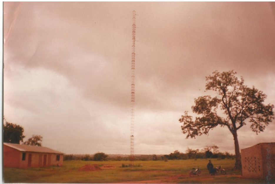
Fig. 4. A relay mast in Tafacirga, Gadiaga in the early 2000s.

several other languages. This was part of a wider revitalization movement of Soninke culture led notably by Demba Traoré. 112 One decade later, with the use of phones as radio sets and the digitalization of radio, RRK regained the ability to broadcast long-distance, and even world-wide, with Soninke diasporic networks proving again vital in the expansion of its publics. Though the wider representation of all segments of Kayesian populations was still a concern of the team, the axis of community-building, where community was understood as ethnolinguistic and focused on Soninke identity, had the advantage of providing a clearer way of defining the station's character in the face of growing competition. 113