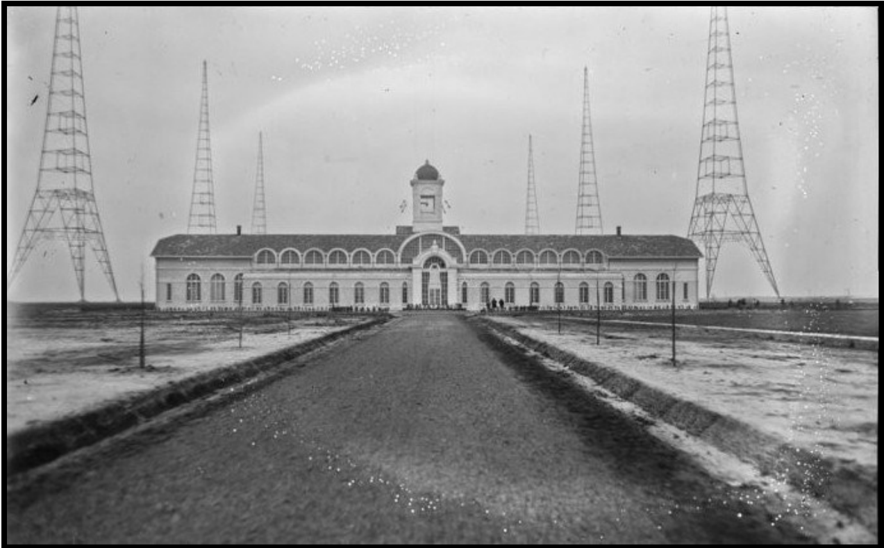
Figure 3 - The Bordeaux transmitter building and six of its aerial towers. It was named Lafayette, after the French Marquis who fought alongside America in the revolutionary war. Construction having started in 1918, it was inaugurated in 1920 and destroyed during the Second World War

Although the technology was ready, Ferrié still had to wait a while. That was because of the complex architecture of post-war science: two newly-established bodies, the International Astronomical Union and the International Union of Geodesy and Geophysics were both interested in the project, and established a joint commission chaired by Ferrié. There followed lengthy technical debates, and much refinement of the project, so it took some years to obtain final approval. But it was finally executed in 1926, and was considered a great success: the closing error of the primary triangle was two-thousandths of a second in time (or less than one metre, expressed in distance). And this 'First World Longitude Operation' was followed by two more, in 1933 and 1958. Whilst the later operations became more international and less French in character, the fundamental techniques were unchanged. Such continuity emphasises the historical importance of Ferrié's memorandum to the Bureau des longitudes in 1919: with it, he defined the techniques of precision longitude determination for the entire wireless era.