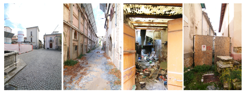
Figure 2. Paganica, November 2019.

This early shock slowed down the pace of our exploration, as we moved among the streets and buildings in a reduced tempo. Walking on and around piles of debris and dirt, our movement was directly guided by the earthquake's traces. Penetrating secondary alleys leading towards the houses' entrances, a broken window or half-open door revealed personal objects mixed with rubble. All these entities were expressive of a present situation while also evoking the haunting of human life past, a twofold condition towards which we sensed a felt-body resonance (Griffero, 2016).