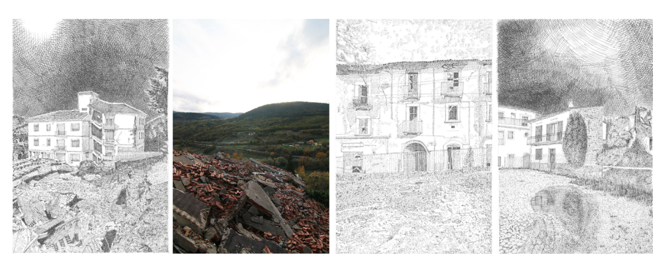
Figure 3. Drawings and photograph by authors From left to right: L'Aquila (1&2), Paganica, Onna

As the walk progressed, our comments expressed an increasing density of emotions: "The more we walk, the worse I feel"; "The atmosphere is haunted." The presence afforded by the expressive array moved us by generating continuous physical movement and corporeal stirrings (Schmitz, Müllan, and Slaby, 2011). The atmosphere became increasingly heavy, with a burden of vague anxiety, and as our steps grew slower, the spoken comments left more space to photography. The disemboweled houses, abandoned objects, a crushed car, the photographs of people who had lost their lives on the night of the earthquake, all somehow 'froze' a dramatic atmosphere from which it was impossible to subtract oneself.