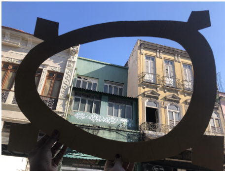
Figure 1. Framing option of a participant, Juliana Queiroz, 2019

Our aim, as researchers as the experiment proceeded was to raise the awareness of inattentive pedestrians “entering” the frames. The research was so captivating that it was not noticed that the groups physically encountered each other multiple times (according to GPS). We were all so focused on looking at the city with new eyes, listening to the brakes of the cars, the music coming out of stores, smelling food and the old beer washed of the sidewalks of a previous party, that all the sensitive elements that had been shown to us, had reached us.