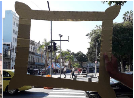
Figure 2. Framing option of a participant, Marília Cavalcanti, 2019