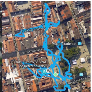
Figure 5. Map of group 3's path, Matheus Mota, 2019