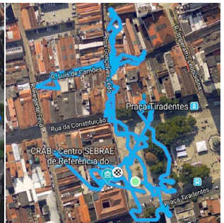
Figure 5. Map of group 3's path, Matheus Mota, 2019