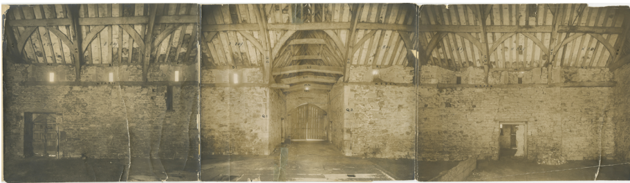
Figure 2. Bradenstoke Tithe Barn interior photomontage, office of Julia Morgan, 1929

Bradenstoke Abbey, founded in 1142 in Bradenstoke, Wiltshire, England, emerged from its hilltop site over centuries. Limestone from nearby quarries and locally harvested English White Oak were used to construct the prior's hall, the priory church, the tithe barn, houses, cottages, and farm buildings through the 15 th century. The tithe barn served to store tithes to the parish, as farmers were required to give one-tenth of their produce to the church. Upon the dissolution of the monasteries ordered by King Henry VIII in 1536, the buildings began to fall into disrepair. The abbey was privately owned by numerous English families over the following centuries, until a sales brochure caught the eye of William Randolph Hearst in 1928. In 1929, Hearst purchased the abbey, deconstructing the priory and rebuilding it at his castle in Wales. The 14 th century stone and timber tithe barn was meticulously documented by employees of architect Julia Morgan, disassembled, and shipped to San Simeon from England.