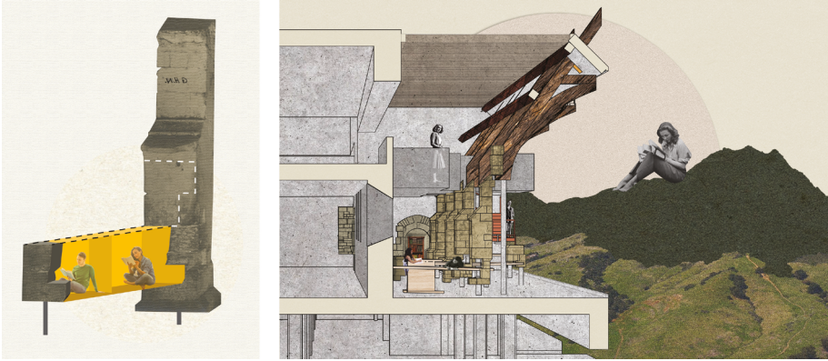
Figure 3. Design Proposal for Library Reading Room, Anja Wimmer, 2020

Multiple stakeholders were involved throughout the quarter, advising and guiding students in the design process. Contributors included library faculty and staff, the owner of the tithe barn, the Director of Hearst Castle, and architects and landscape architects from around the country. Understanding that “Atmospheres cannot make people feel particular things...anticipation, foreknowledge and pre-existing views of different material and immaterial elements play a crucial role in how atmospheres are co-constituted and perceived (Sumartojo 2016),” it was valuable to have the input of a range of stakeholders (Sumartojo and Pink, 2019, 5).