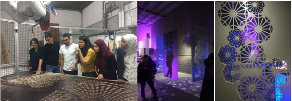
Figure 1. Fabrication with Robotic arm in RDL - ENSAG (to the left); Photos of the fabricated panels in “Resilience” exhibition

The start of the workshop consisted in choosing in Cairo, references of traditional architecture, (such as moucharabiehs, claustra or zenithal lightning of engraved or sculpted patterns) from the Islamic, Coptic, Nubian or Pharaonic cultural heritage, to be photographed. We therefore realized, with 7 groups of students 4 reference fields that Noha categorized with Egyptian students into a set of emblematic prototypes of a reactivation of traditional ornamentation using contemporary modeling and manufacturing tools available in Digital RDL and in the GAIA. One of the qualities of this workshop is the collaborative work between the students of each of our universities for the drawing, the production, the staging in LEICA (an immersive space of architectural design) and the final presentation. Finally, as part of the “Resilience” exhibition for which Amal was the curator, she chose to show and make visitors experience the passage from the representation in mock-up to the sensitive space of the experience. Each project is presented according to this tensioning of the small scale and the scale of the moving body.